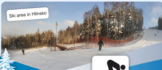
Ski area in Hlinsko